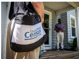
Official 2020 Census bag